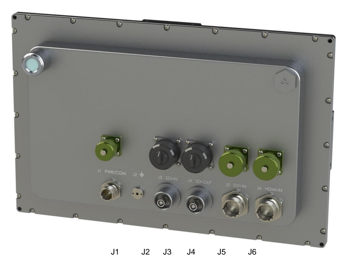
Figure 3-2: Connections

Connector J6, "HDMI IN", an HDMI Input connector.